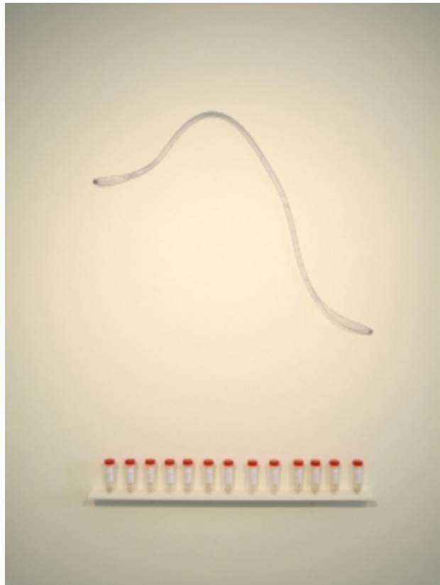
Is the bridge flowing or the river, 2012 installation, variable