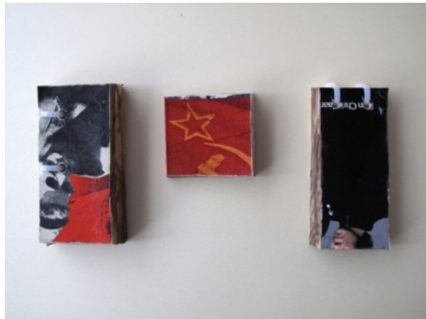
Instead of words, 2012 installation, variable