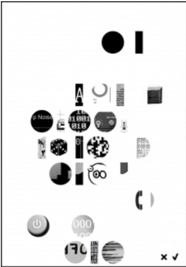
A4s, 2014 booklet, A4