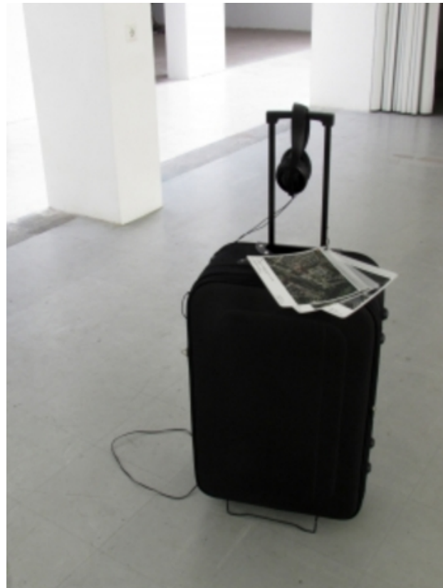
Trac(e/k), 2014 installation-sound, variable