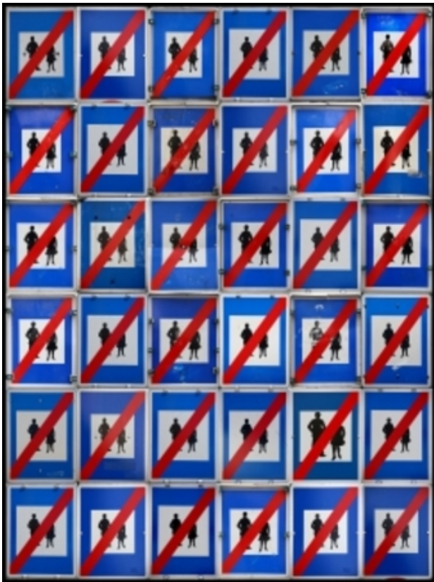
The Michel behind the mask, 2012 photography-publication, variable