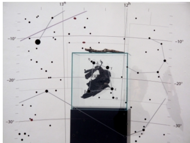
Why is the crow like a writing desk, 2013 installation, variable