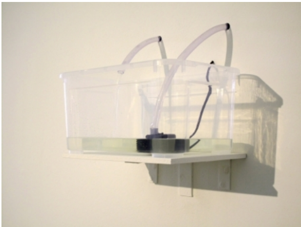
Is the bridge flowing or the river, 2012 installation, variable