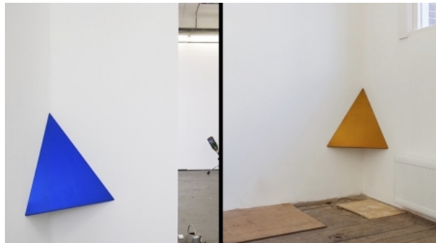
Prohibited blue, Prohibited Copper, 2015 spandex op hout