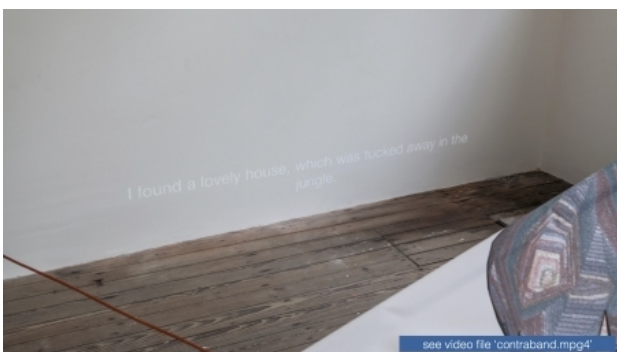
Contraband, 2015 HD video, 07:45min continuous loop