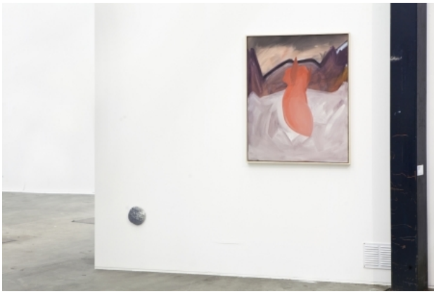
Moon ; Glacier ; Vent, 2016 gips wandsculptuur ; olieverf op doek ;