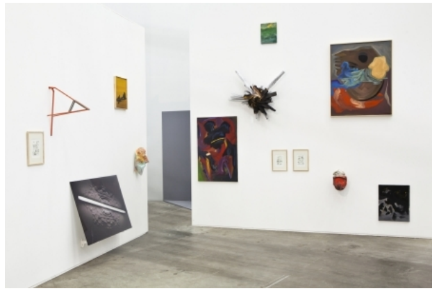
..., 2016 olieverf op doek, pur, verf, verkoold sc