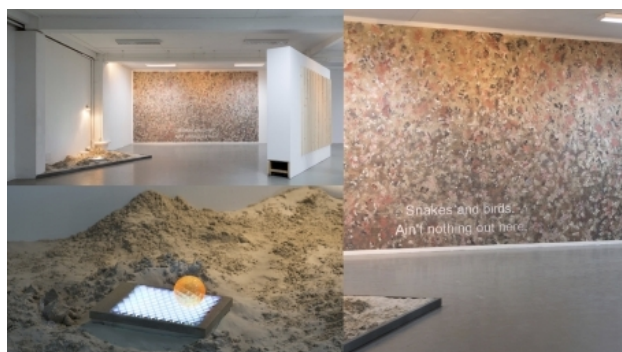
Detourist, 2014 cement, metallic verf, zand, gezichtsbru