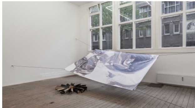
Prop V2 + Shroud + contraband, 2015 print op pvc (shroud) ; verkoold sculptuur