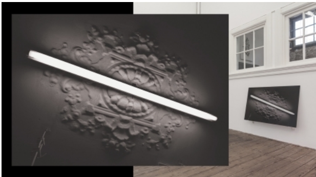
Ornament, 2015 foto op plexiglas, 100cm * 70cm