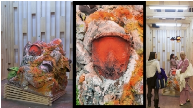
Shrine Arena, 2015 paintball maskers, verf, cement, beton,