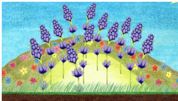
Towards tranquility, sanguinity, 2024 video (10:59), -