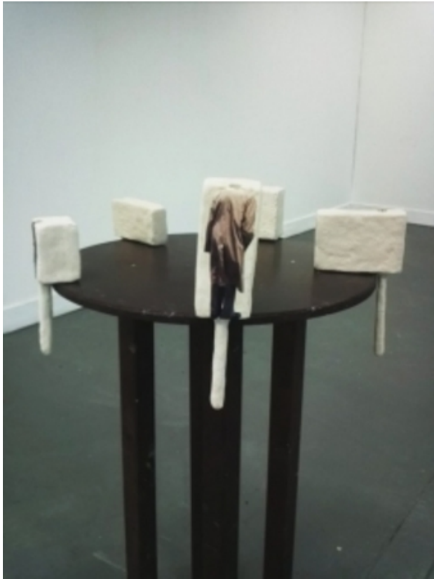
Unavailable, 2013 Sculptuur