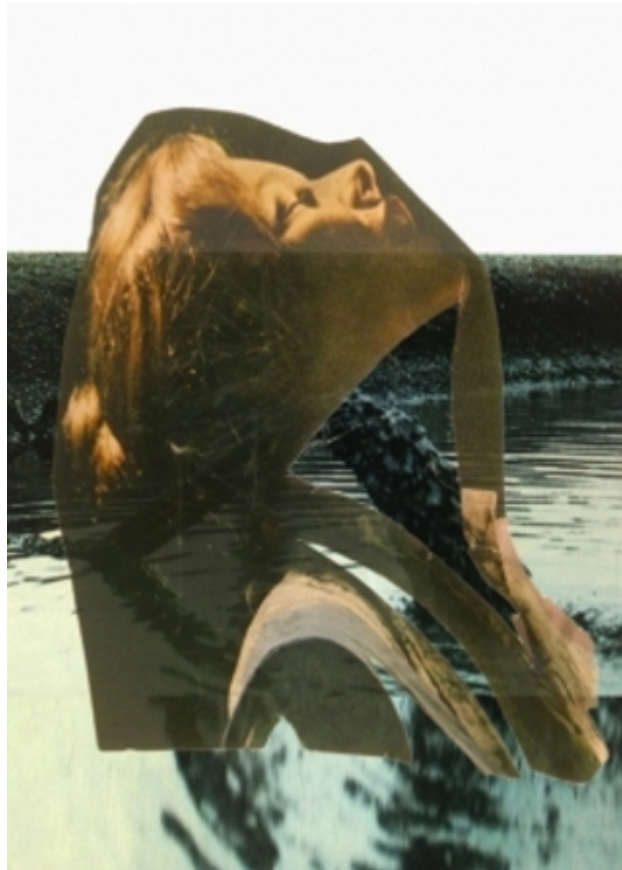
Fill her, 2015 Collage