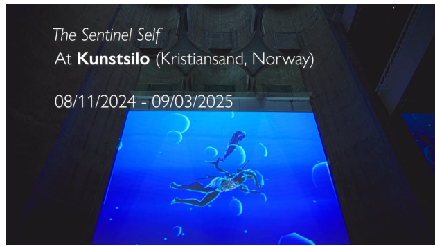
The Sentinel Self - Kunstsilo, 2024 04:10