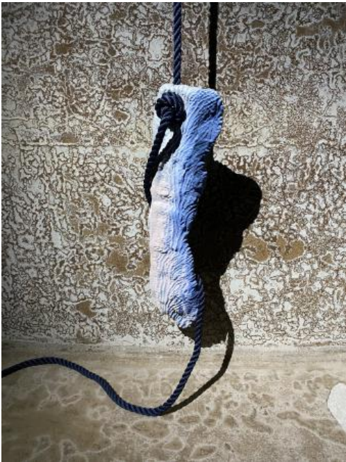
The Portal, 2023