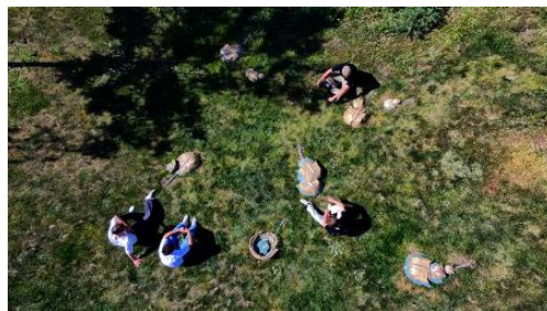
Strange Kinship, 2025 Ceramics, n/a