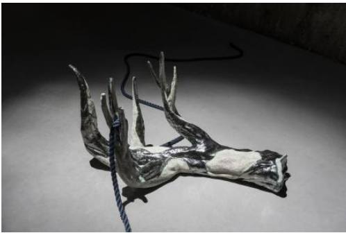
The Portal , 2023 Ceramics