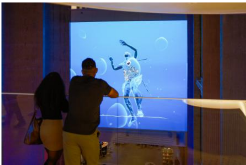
The Sentinel Self, 2024 Unity simulation, n/a