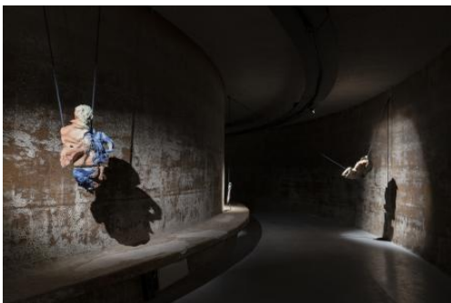
The Portal, 2023 ceramics , n/a