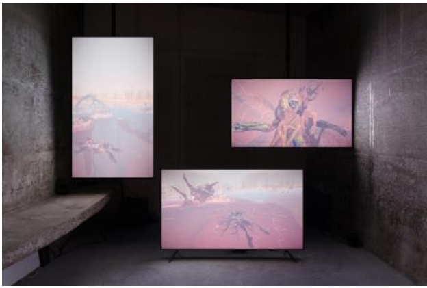
Sphagnum Time (Braiding Fates), 2023 Digital animation 3 video channel / 8 sound channel, n/a