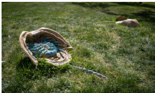
Strange Kinship, 2025 Ceramics, n/a