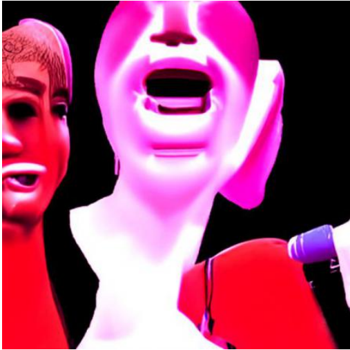
In Search of Good Ancestors, 2022 generative radio broadcast, AI, workshops