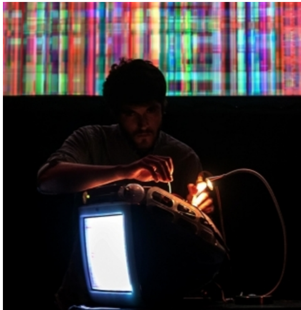
iMac Music, 2017 performance, audiovisual, outsider art