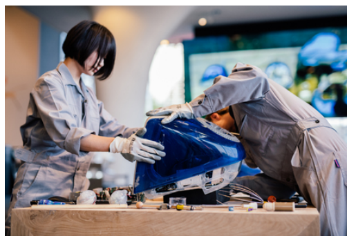
if this then that, 2018 performance art, music composition, video