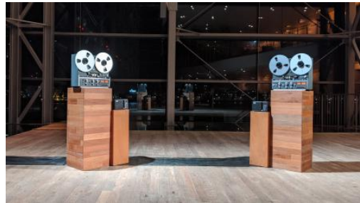
Wordless, 2020 robotically controlled tape machines, machine-learning corpus-based speech synthesis system