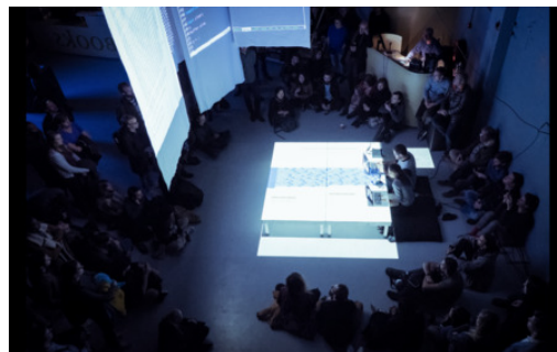
Anatomies of Intelligence, 2019 web-based, performance, algorithms, catalog of research