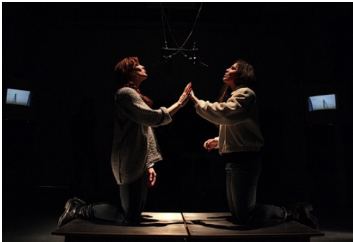
Satellite Skin, 2017 sculpture-performance, installation, app