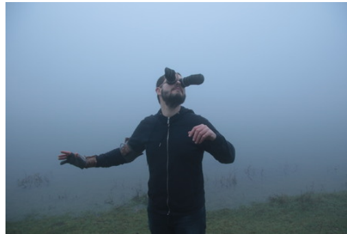
Sensory Cartographies Institute, 2016 worn instruments, speculative research