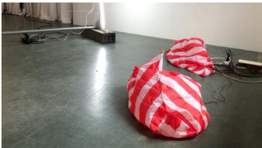
Symbiotic Spaces | Stockholm, 2021