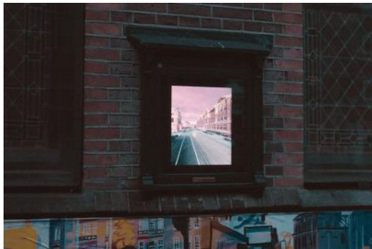
Vec4(red,green,blue,alpha), 2024 Generatieve virtuele 3D omgeving op scherm, 41 x 33 x 4 cm