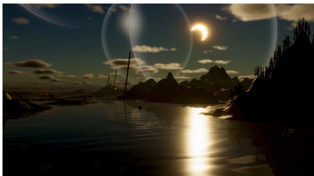
Flowing Grounds | Stockholm, 2022 01:48