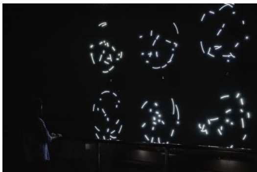
Red Horizon, 2025 kinetic, sound, light installation