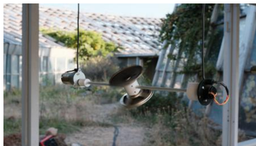
The Monads, 2025 kinetic, sound installation