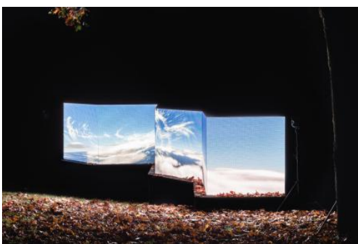
Airborne Landscapes, 2022