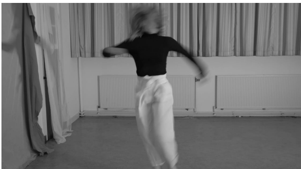
SPIN, 2019 5