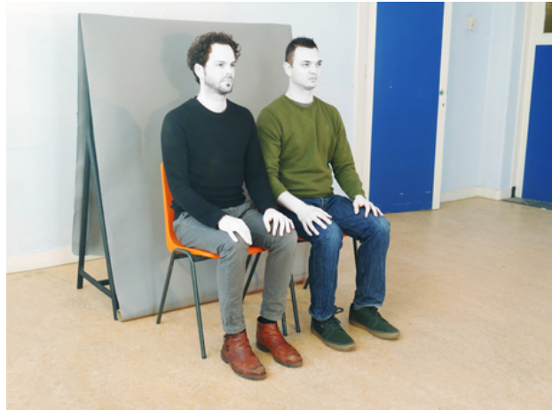
Alkaloid , 2019 foto