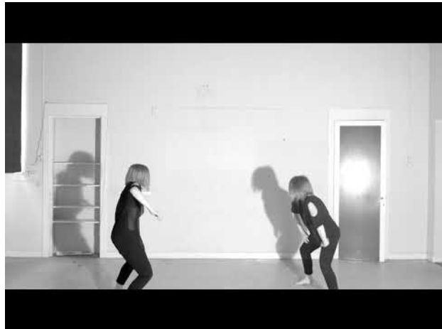
SPLIT, 2019 6