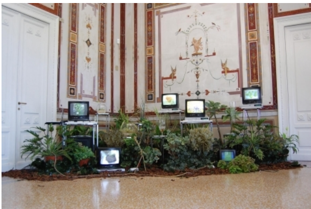
Post Human Garden, 2011