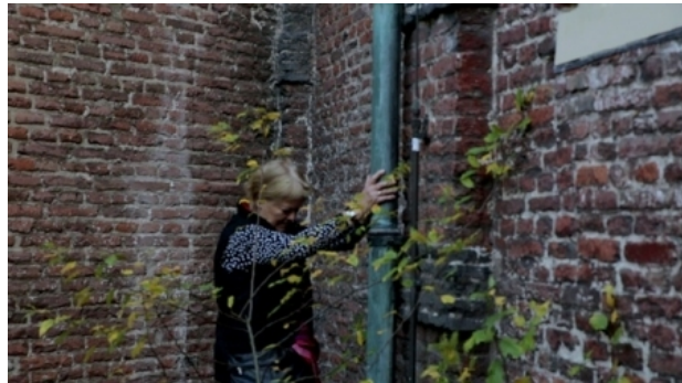
Raindrop in het kruithuis, 2013