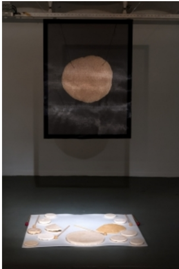
Tang- sugar instrument, 2015 crystallized sugar