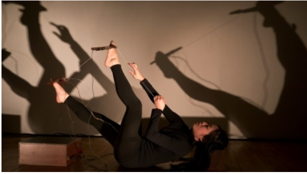
OHHO-body cello, 2013