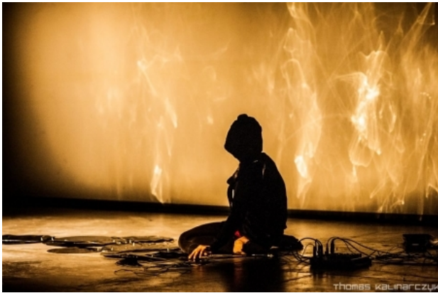
the forest inside me kept me in it like, 2014