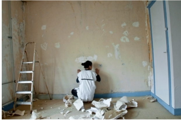
Jhih Chiang/Paper Wall, 2011