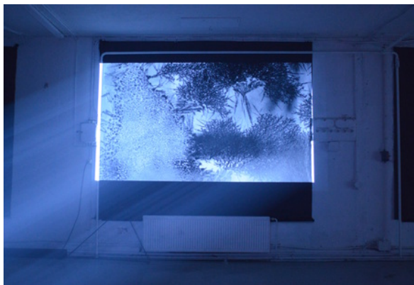
RE:SET, 2018 Video, installation