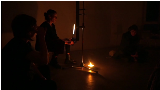
Modes of Motion, 2018 3:57