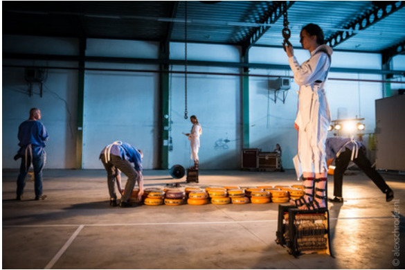
Magnetoceptia - Tip The Scales in a Gambler's Favor, 2017 Mixed media, performance