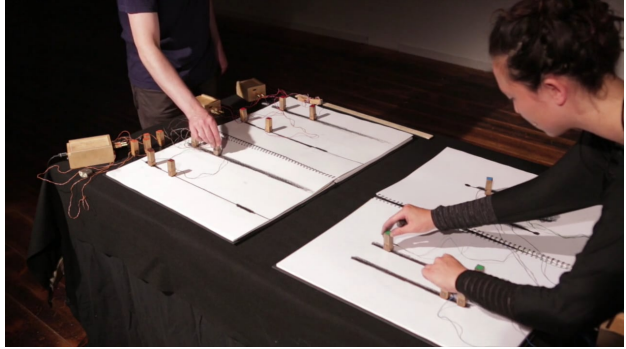
Ground, 2016 1:08