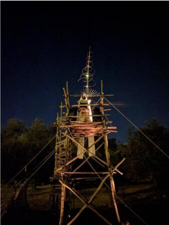
Magnetoceptia, The Signaller #CQ , 2017 Mixed media, performance