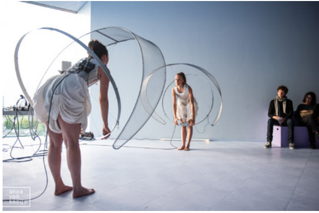
Magneptoceptia - Crinolettes | Gyration Resistance, 2019 Mixed media, performance, 300x300x100