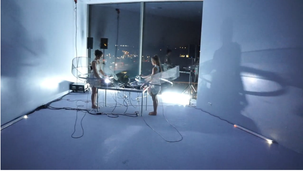
Magneptoceptia - Crinolettes | Gyration Resistance, 2019 04:02