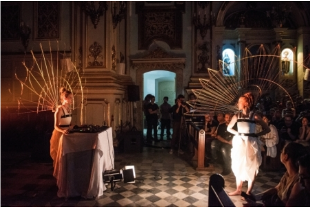
Magnetoceptia - Maria de' Medici and Maria Stuart, 2017 Mixed media, performance, 300x150x50