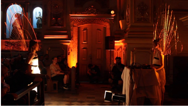
Magnetoceptia - Maria de' Medici & Maria Stuart, 2017