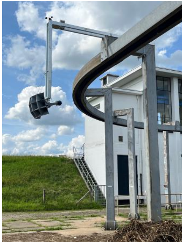
The Living Pump Station, 2025