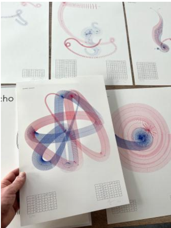
Echo Moiré graphic score, 2024