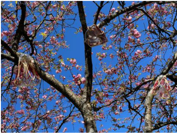
Chorusing Symbionts, 2026

2013 - founding member and Chairman of iii 2024