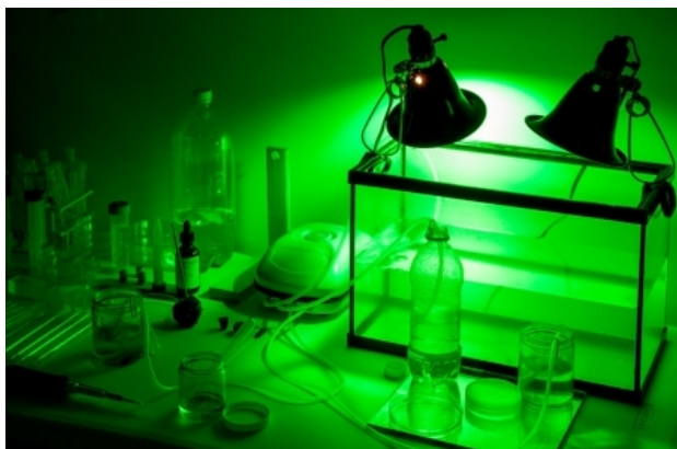
microscope Chamber #1, 2013 photo documentation of the installation