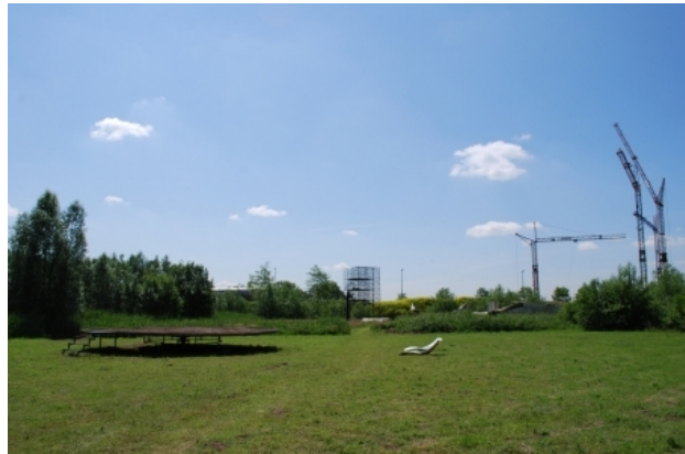
Solar Flares, 2012 photo documentation of the installation