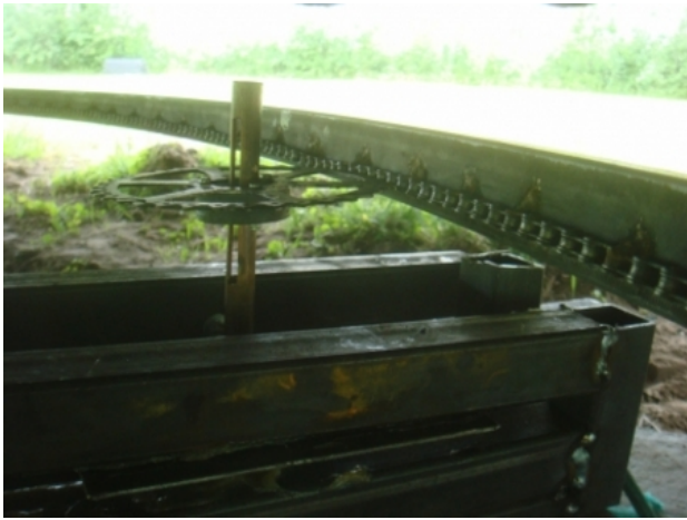
Solar Flares, 2012 photo documentation of the installation