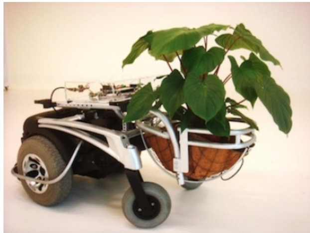
Prototype for a New BioMachine, 2012 hybrid-machine+plant