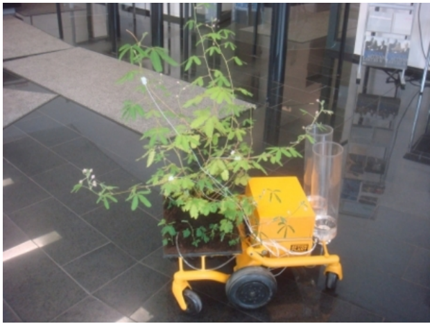
Jurema Action Plant, 2010 hybrid-machine+plant, 70x50x50