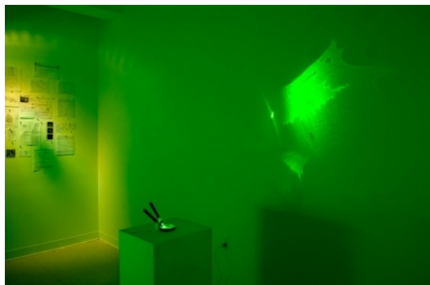
microscope Chamber #1, 2013 photo documentation of the installation