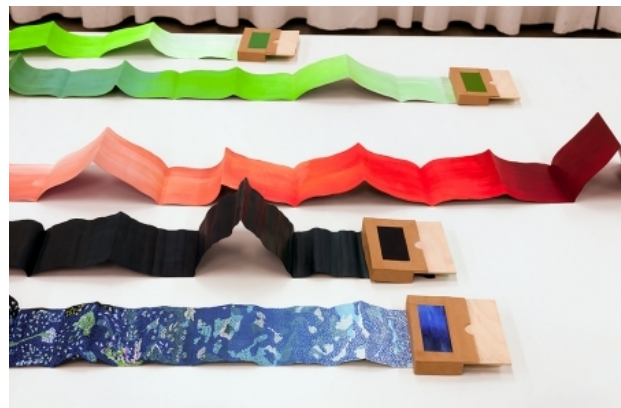
'Portable Landscape in your Palm', 2015 Mixed media, varied