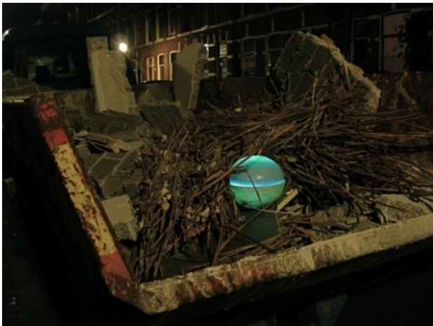
'oUt of rAngE', 2009 Collected paraffin, led light, battery., varied