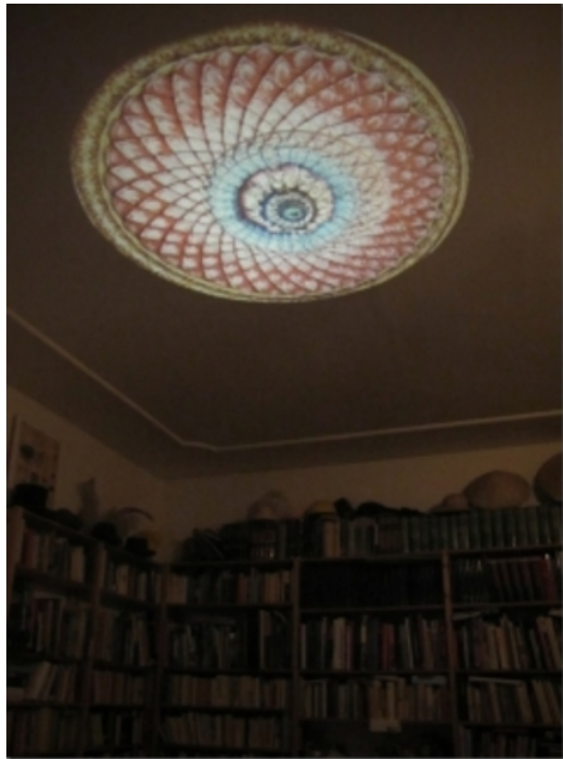
'Echo and Narcissus', 2010 Miniature drawing, mixed media., varied