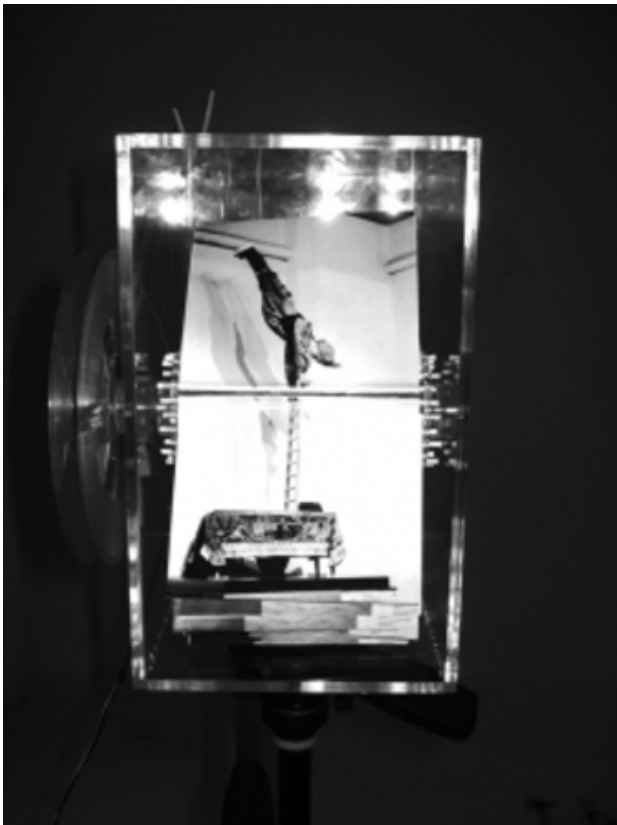
'The Acrobatics of the Artist', 2014 Animation machine-Collage, Box:35x50x35. Tripod: 168cm