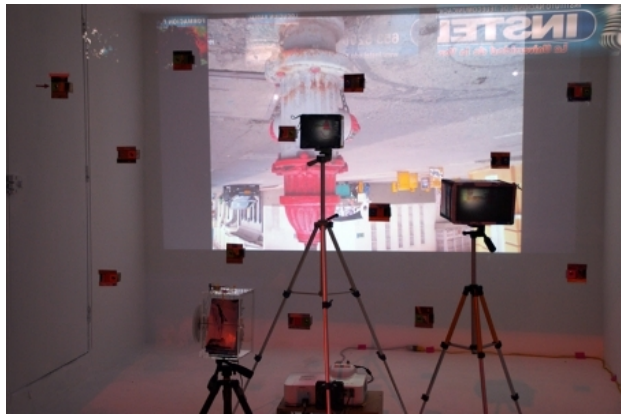
'From the Window to Voyeurism', 2014 Installation-Collage, varied