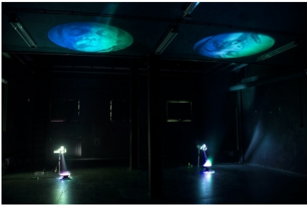
'Narcissus II', 2012 Experimental video-performance, varied