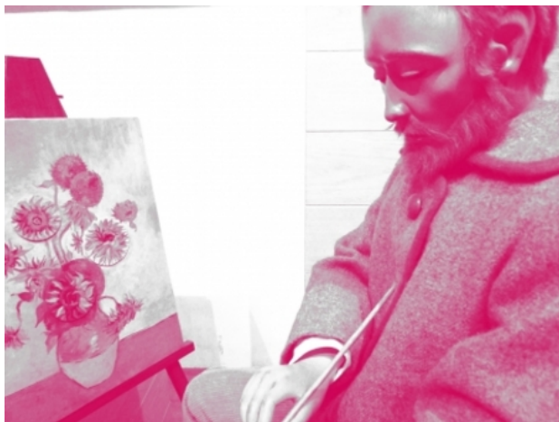
'The Artist as Puppet Machine', 2016 Sonic flipbook, 15x20 cm