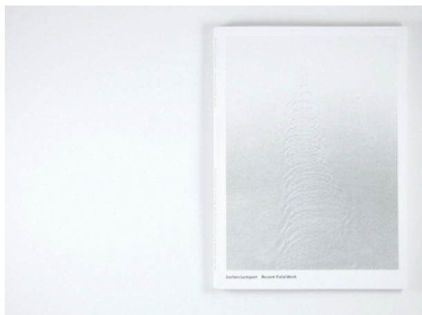
Jochen Lempert: Cover, 2009 offset, 20×27.5 cm