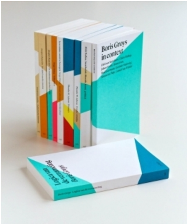
Octavo publicaties, 2013 Offset, 11.7x18.5