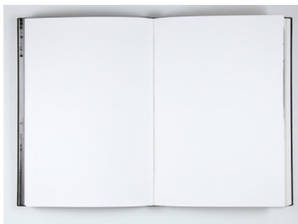
1+1+1=3, Spread, 2008 offset, 17×24