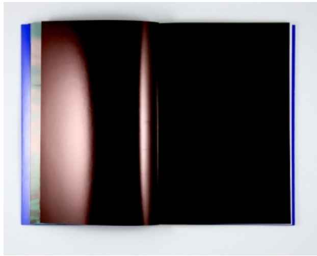
Miguel Soares: Spread, 2008 offset, 15.6×23.5