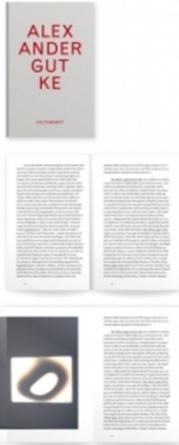
Alexander Gutke, 2011 Offset, 11.5x17.5cm