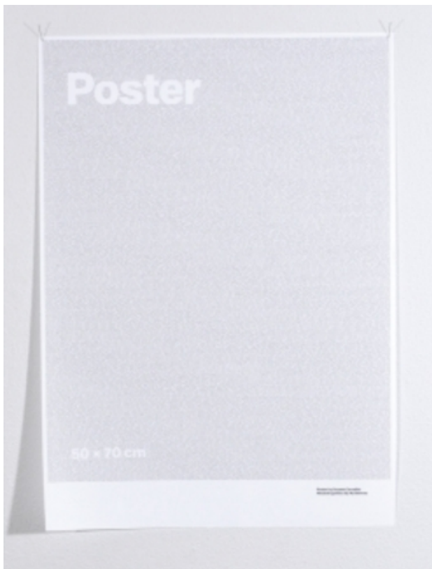
Poster, 2005 offset, 50x70