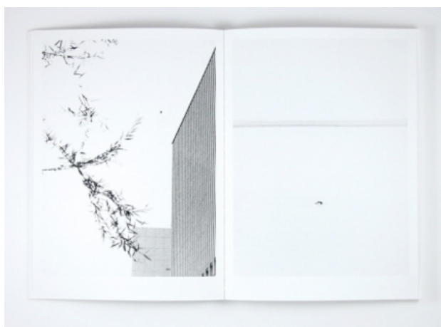
Jochen Lempert: spread, 2009 offset, 20×27.5 cm