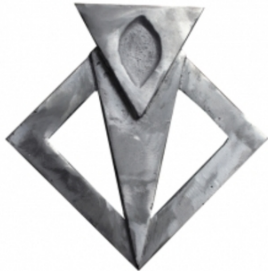
Object 2, 2016 Aluminium, 23x23x3