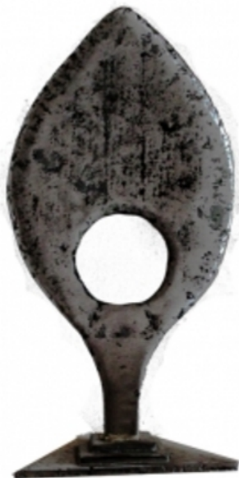
third eye, 2017 Aluminium, 30x10x6cm