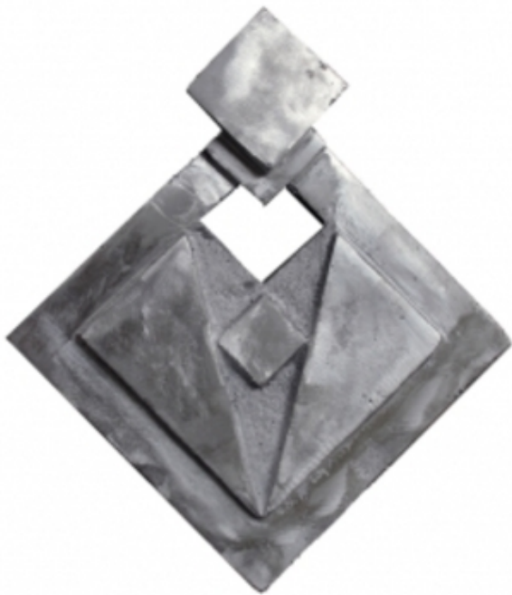
Object 1, 2016 Aluminium, 23x23x3