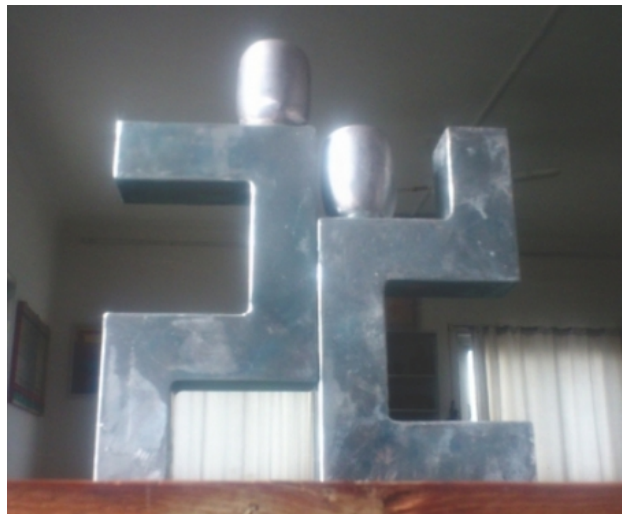
Duo 1, 2017 steel, 36x20x6cm