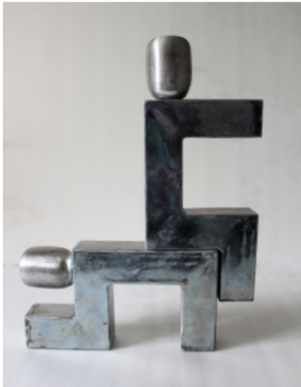
Duo 2, 2017 steel, 40x20x6cm