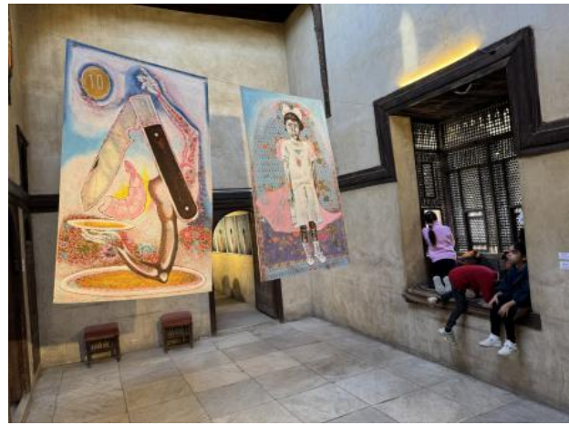
For that amount, he bowed like a penknife + Sewing fee: One guilder, 2024 oil/acrylics on artificial/factory java wax print, 180 x 120 cm. (double-sided)