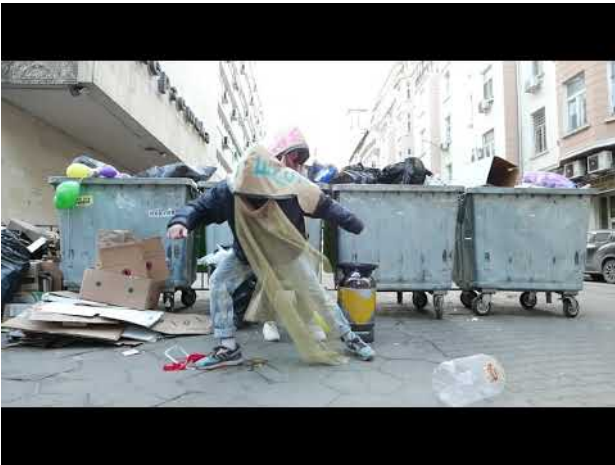
B/Esties, 2020 2:22