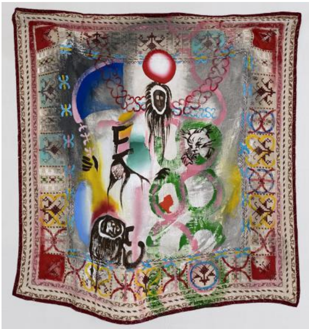
Dreaming of Home, 2022 Oil/acrylic/table cloth, 67 x 67