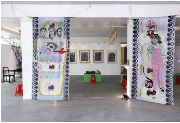
It's not the eyes that can't see, but the hearts that are blind - Pray for us (left), Children of God - Anak Tuan Allah (right), 2025 acrylic and oil on artificial Javanese waxblock print fabric, ±115 x 245 (double-sided)