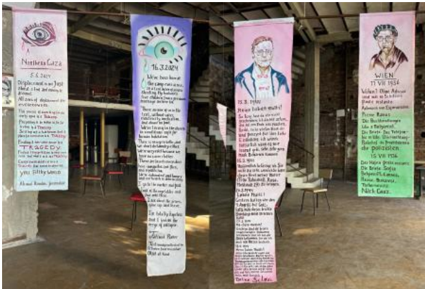
Dearest mom, 2024 Olie-/acrylverf op linnen, 140 x 40 + 200 x 45, double-sided