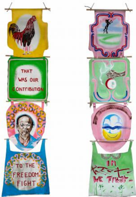
In roosters we trust, 2024 Olieverv/acryl/canvas, ± 200 x 50 cm. dubbelzijdig