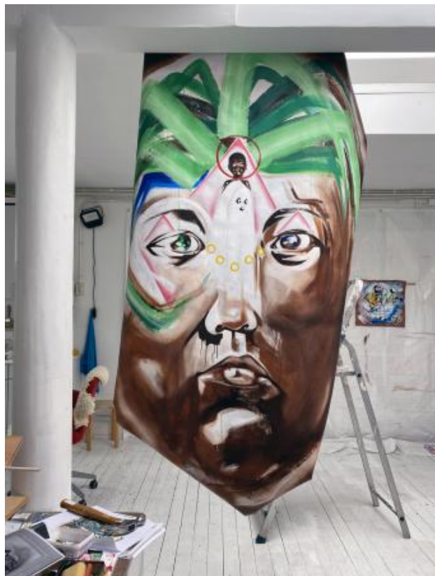
Head, 2022 2020-2022, canvas/oil/acrylic, 210 x 145