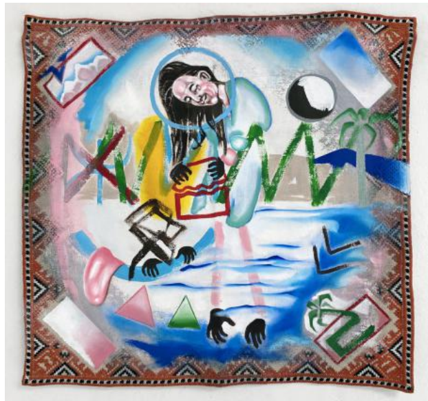
In search of, 2021 oil/acrylic/table cloth, 50 x 50