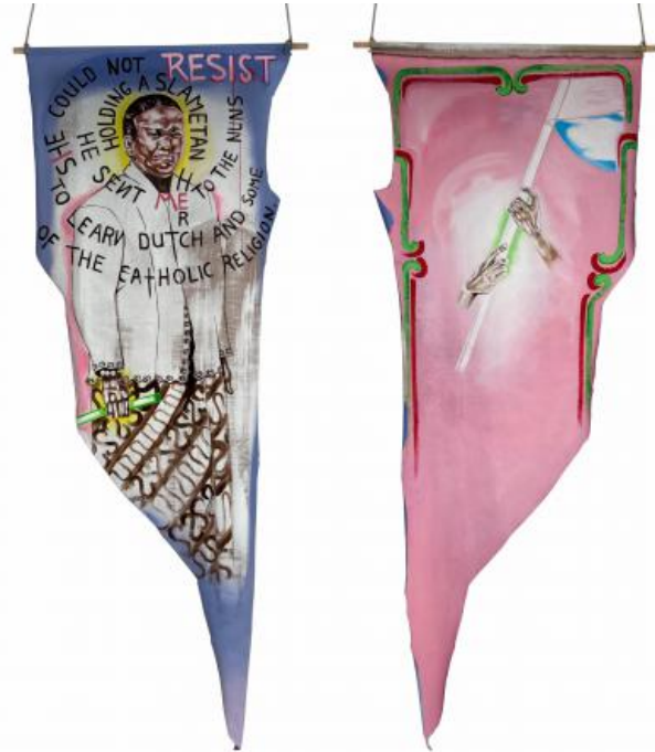
Resistance, 2024 Olieverv/acryl/canvas, ± 200 x 80 cm. dubbelzijdig