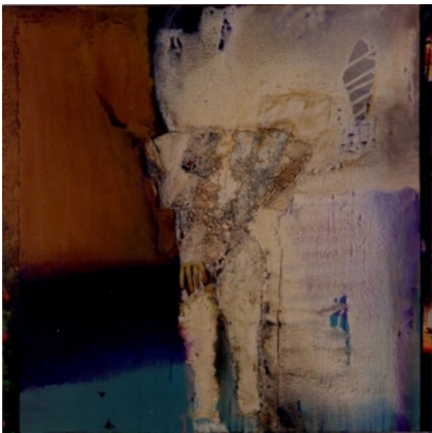
Explosion, 2002 Oil on Canvas, 100x100