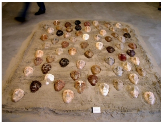
To whom it may concern, 2004 Terracotta and sand, 180x220