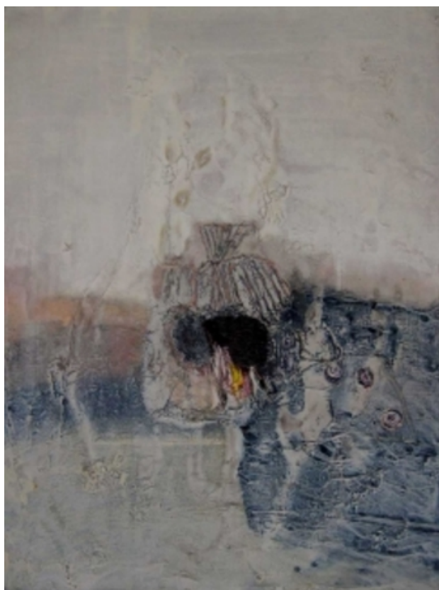
Detail 2, 2004 Mixed Media on paper, 56x76