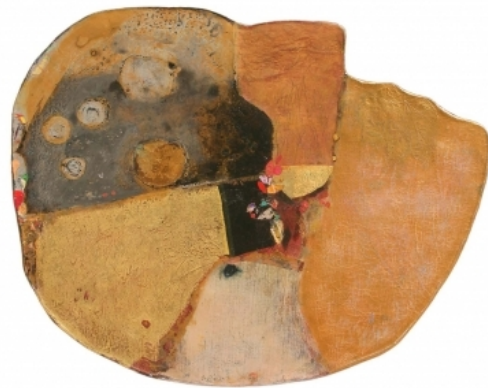
Out of...., 2007 Mixed Media on Canvas, 80x100