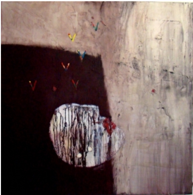
Untitled 2, 2008 Mixed Media on Canvas, 150x150