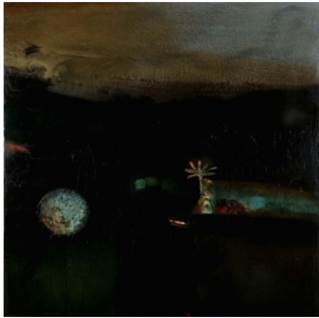
Basrah Night, 2008 Oil on Canvas, 120x120