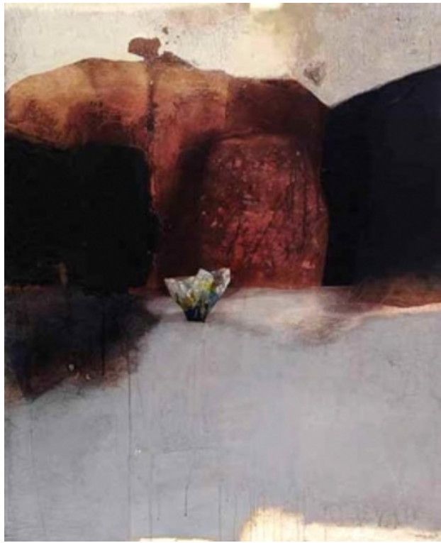
Untitled, 2004 Oil on Canvas, 130x160