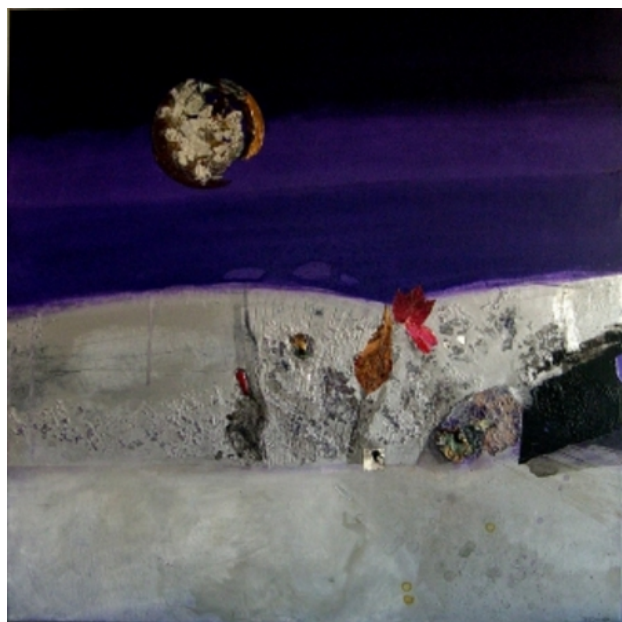
Landscape, 2006 Oil on Canvas, 100x100