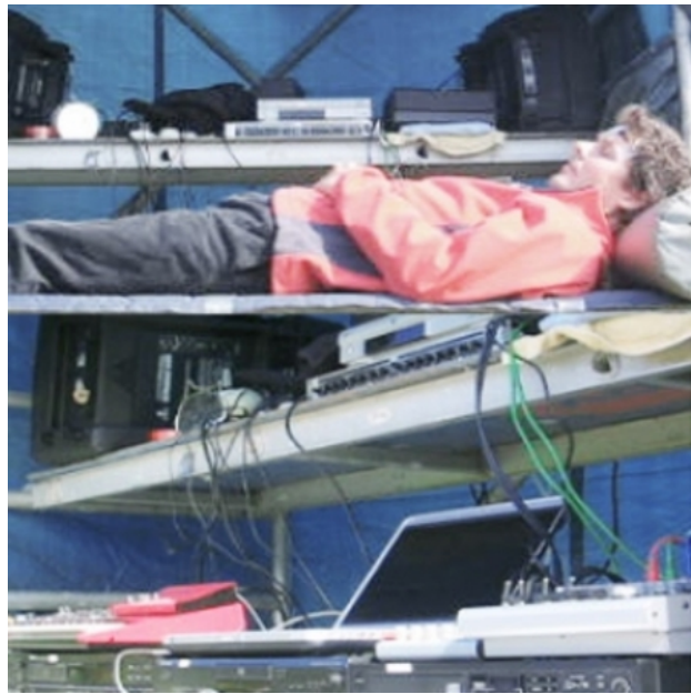
Het bewustzijn van een park, 2004 Geluidsperformance/installatie, 40000x20000