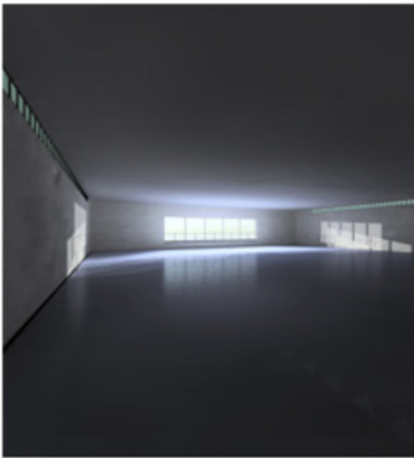
langste dag in de studio, 1999 cgi, 90x90x110