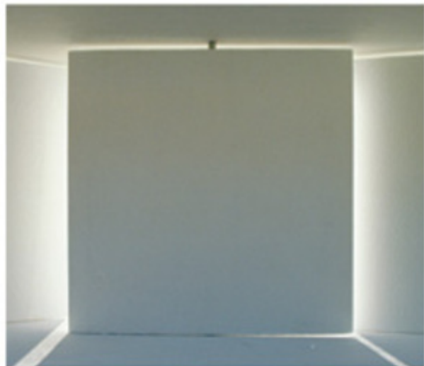
Equator #35, 1998 fotografie, 40x45