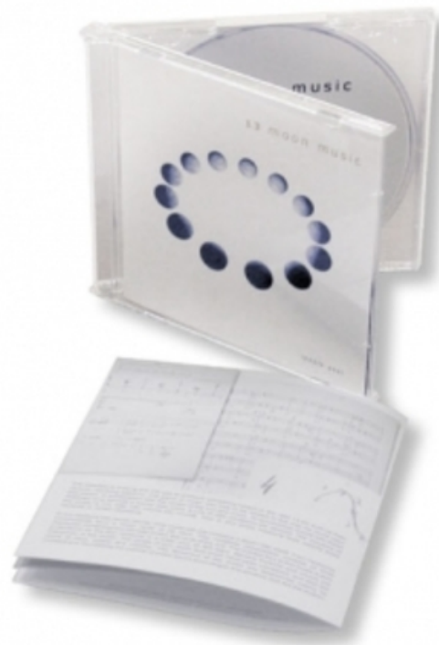
13 Moon Music, 2006 Audio cd + boekje, nvt