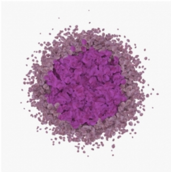
Vallende bladeren (Bougainville), 2008 photographic print on dibont, framed, 112x112